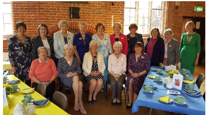
Merry Band of helpers!

MVO, the Queen’s Swan Marker, was a fascinating speaker and it was so good to find a lot more about the job of the Swan Marker apart from the amazing spectacle it provides every year on the Thames every July.